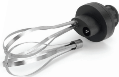
Accessory Sold Separately